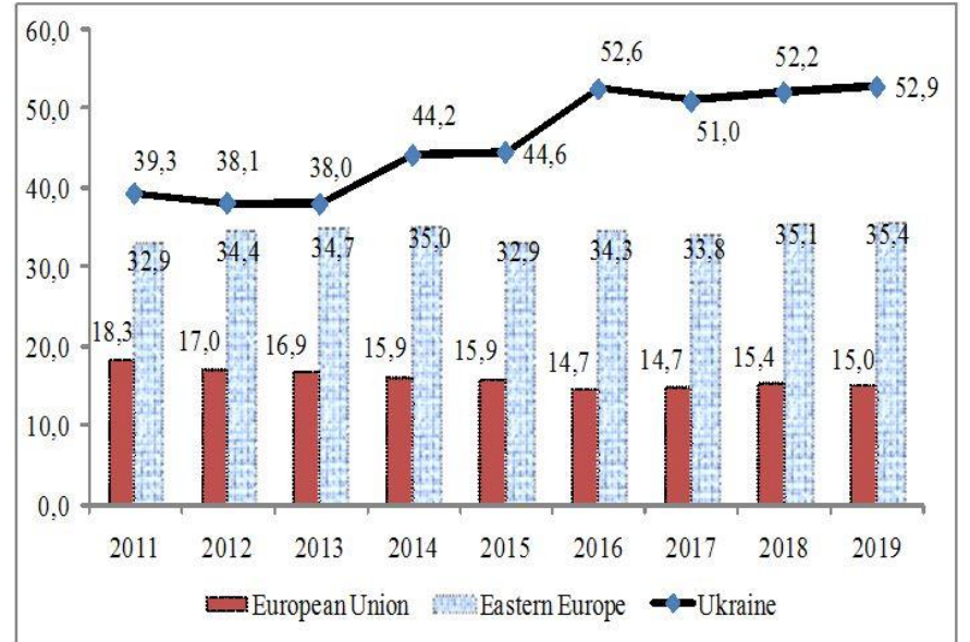
Figure 1. The share of current accounts payable (including other current liabilities) in business financing, % balance sheet assets

is much higher than in the EU countries, where during the same period it decreased from 18.2 to 14.9% (Fig. 1). Also, the share of current accounts payable in business financing in Ukraine significantly exceeds the corresponding indicators of some Eastern European countries (Bulgaria, the Czech Republic, Hungary, Romania). The excess of this share in business financing in Ukraine compared to EU countries increased from 21.1 percentage points in 2011 to 37.9 percentage points in 2019, while the average value for the above mentioned Eastern European countries - from 6.4 to 17.5 percentage points. Such large-scale deviations give grounds to conclude about an abnormally high share of current accounts payable in business financing in Ukraine.