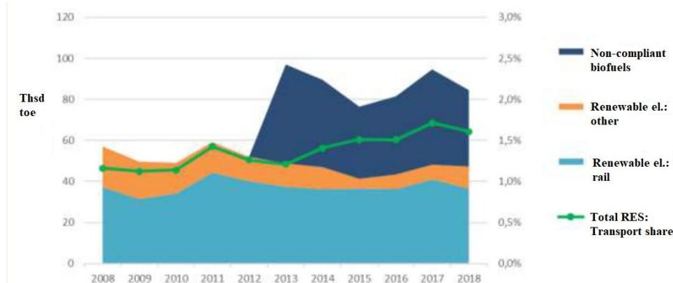
Figure 3. Consumption of energy from renewable sources in Ukraine's transport sector before 2019

But so called renewable electricity in railways, road transport (electric vehicles) and other forms of transport is included in the above category. Research [28] indicates that Ukraine could achieve even 13.8% of energy from RES in the transport sector in 2030, with the following contribution of the energy carriers: